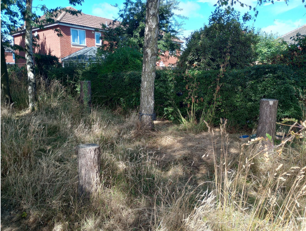
Stumps of trees removed remain on site

Some properties are situated close to the tree belt