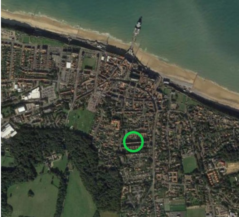
Aerial map of Cromer Google