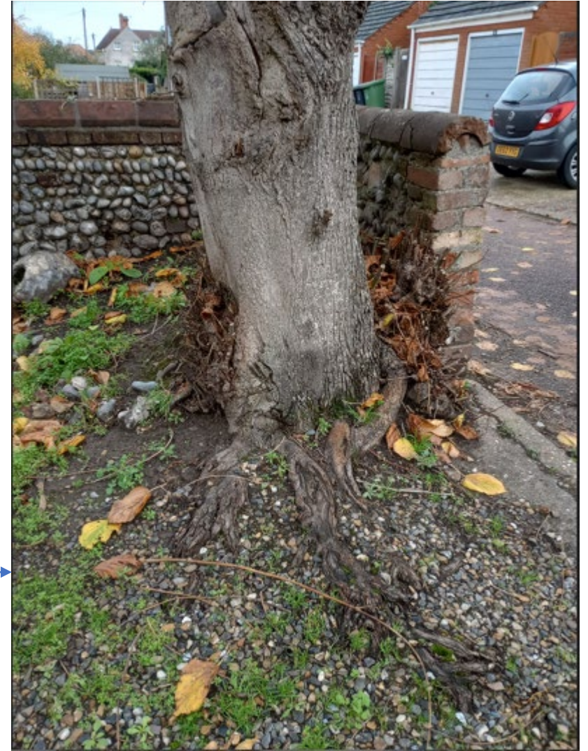
Close up of roots and stem →