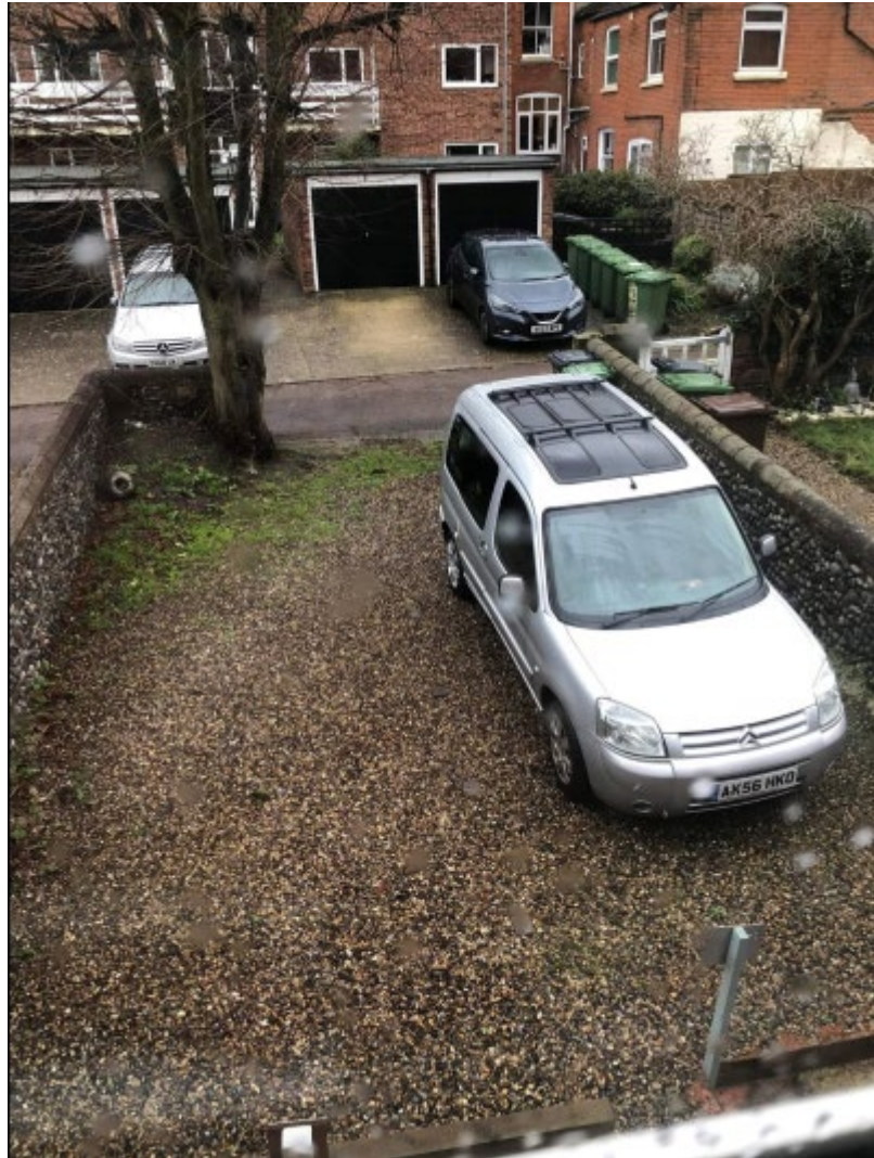
Image supplied by residents showing parking constraint