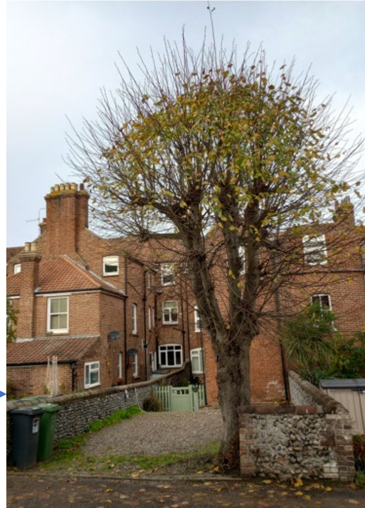
View of entrance to rear garden / parking area →