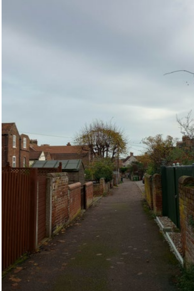
← View from The Loke towards St Mary's Court