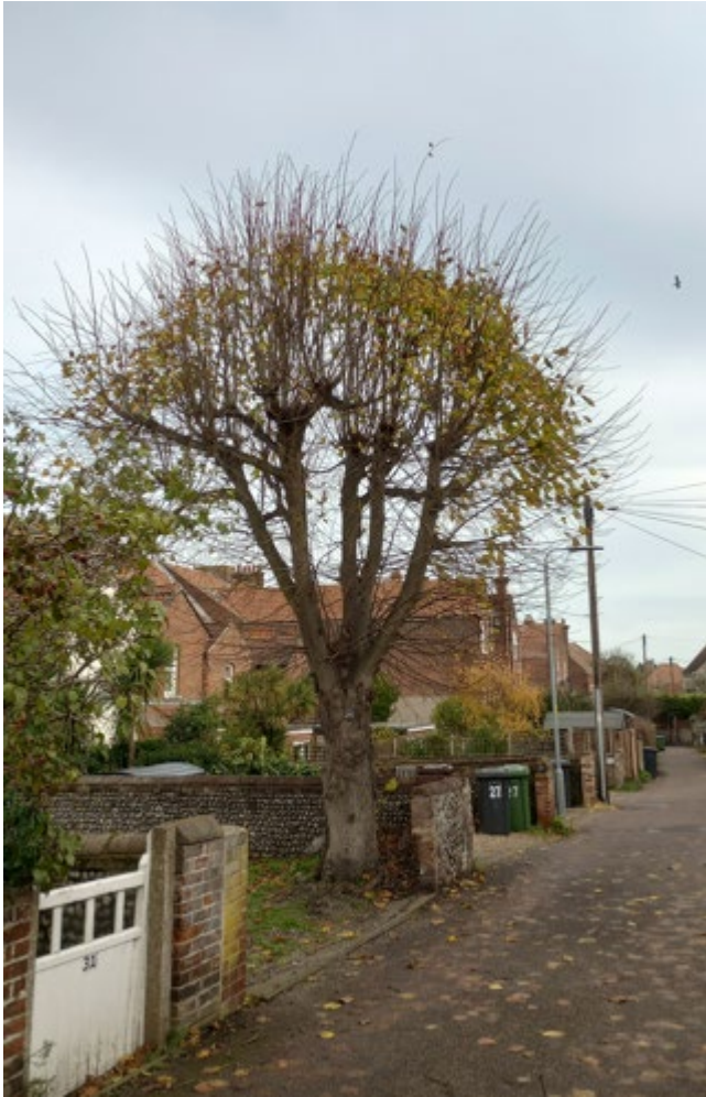
← Image of tree, close to wall