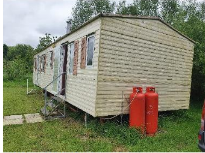
Photograph 1: The caravan