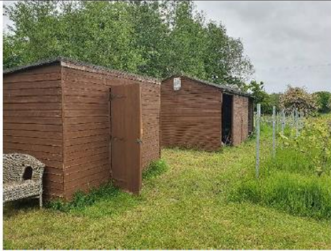
Photograph 2: Wooden out-buildings