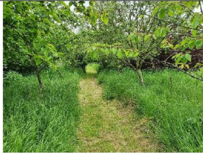
Photograph 4: The orchard