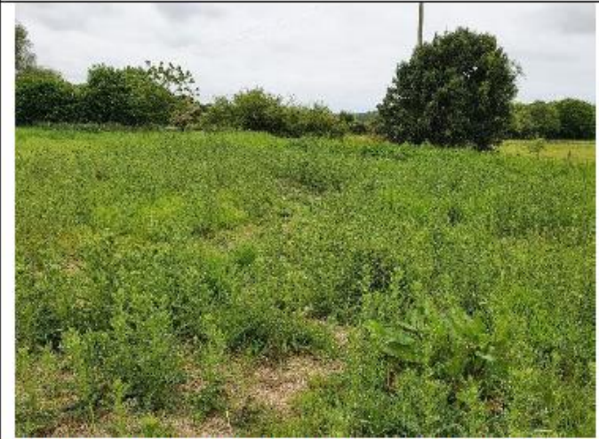
Photograph 6: Modified grassland – thistle dominated patches