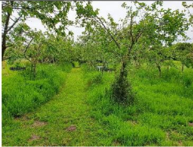
Photograph 5: The orchard