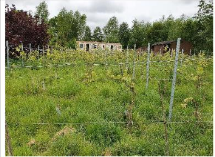
Photograph 3: The vines