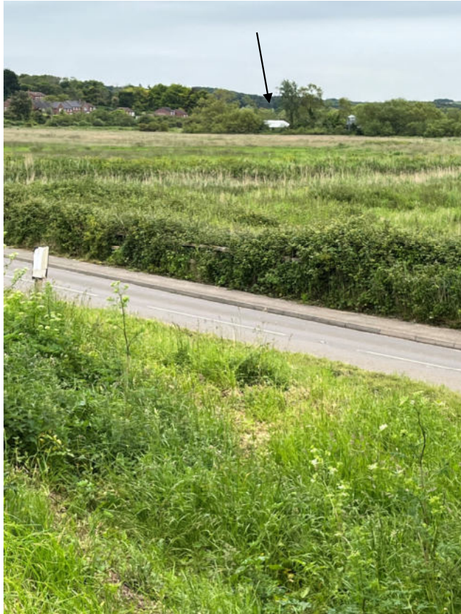
From Norfolk Coast Path