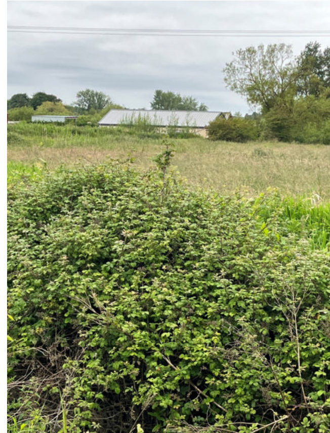
Southwest from Holt Road