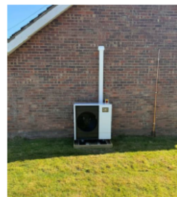
Air Source Heat Pump