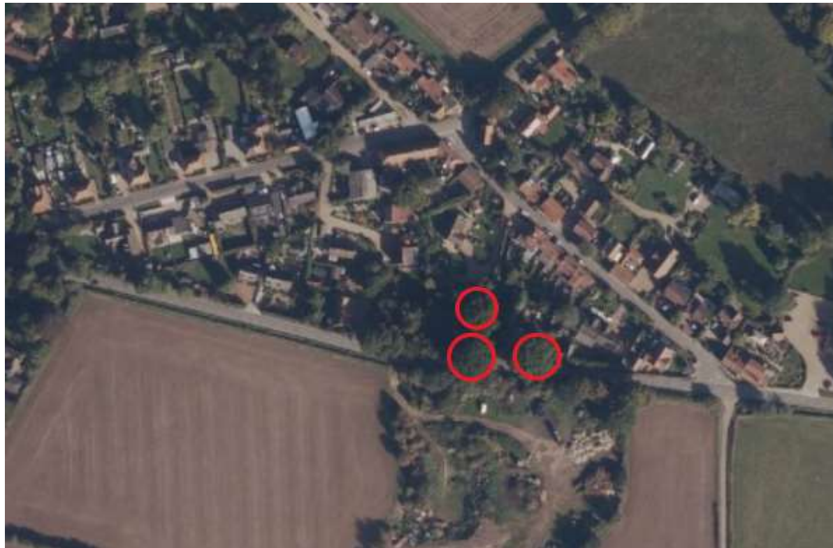
Aerial map 2022